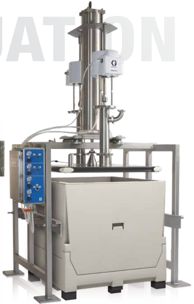
SaniForce BES (Bin Evacuation Systems)

Available with SaniForce 5:1 or 6:1 Piston Pumps, or SaniForce 3150 HS Diaphragm Pump up to 1,000,000 cps*