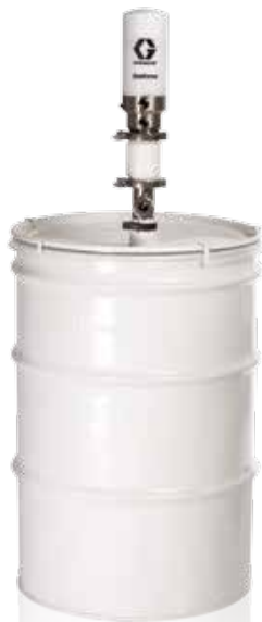
SaniForce 2:1 Piston Pump up to 50,000 cps