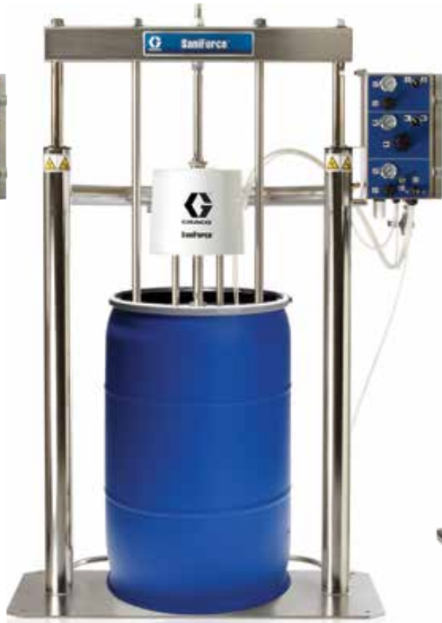
SaniForce Piston Pump Drum Unloaders

Available with SaniForce 5:1, 6:1 or 12:1 Piston Pumps up to 1,000,000 cps*