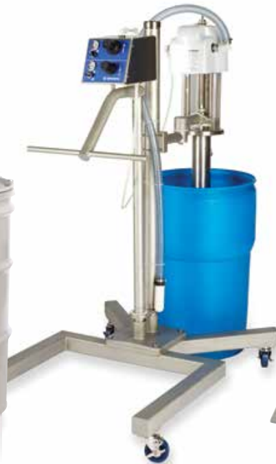
SaniForce Elevator Use with SaniForce 2:1, 5:1 and 6:1 Piston Pumps up to 150,000