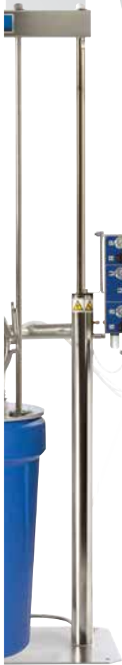
2150 gm Pump Available with SaniForce 5:1 or 6:1 Piston Pumps up to 1,000,000 cps