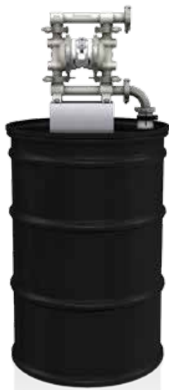
SaniForce 515 FDA Diaphragm Pump with Drum Kit up to 5,000 cps