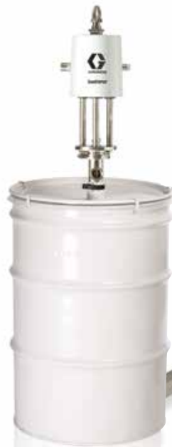
SaniForce 6:1 Piston Pump up to 100,000 cps