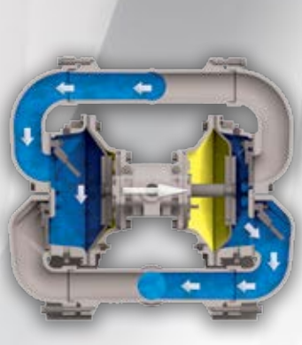
Heavy Duty Flap