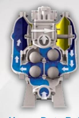
Heavy Duty Ball