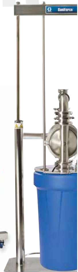
SaniForce Diaphragm Drum Unloader Available with SaniForce or 3150 HS Diaphragm up to 100,000