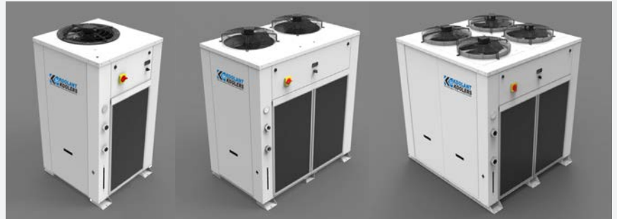
3 & 5 Ton Layouts