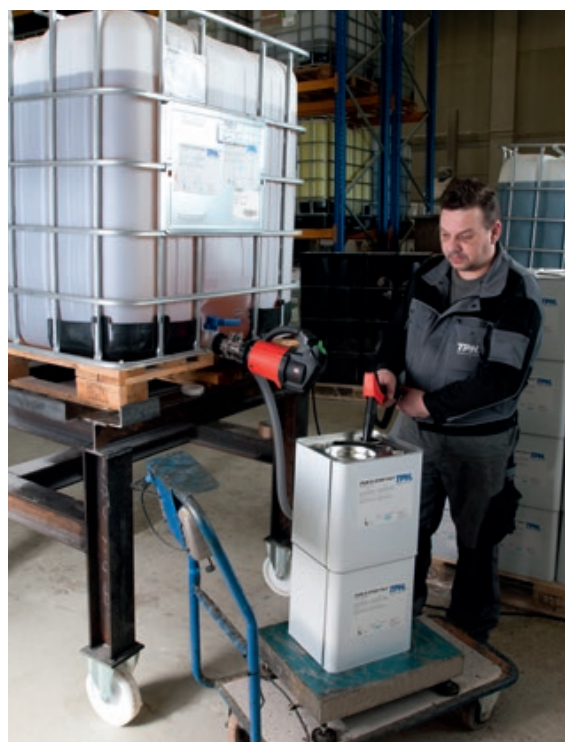
Fast container filling from the IBC outlet.