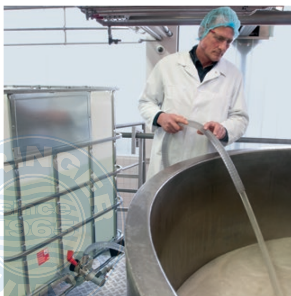
Pumping upward into a mixing container from the IBC outlet.