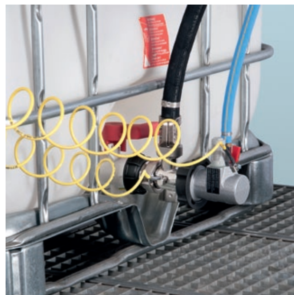
Also suitable for use in explosion hazard areas of zone 1.**