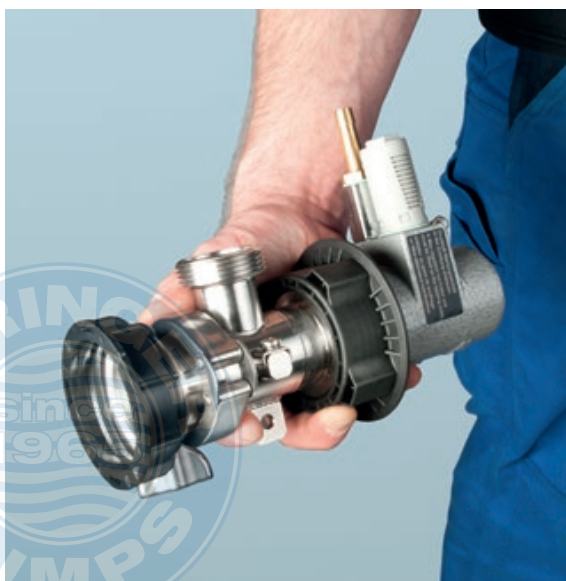
Extremely compact and light.